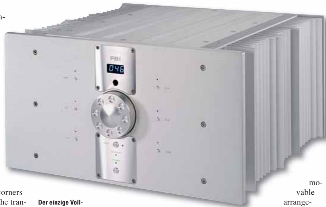
Der einzige Vollverstärker, der einem Emitter II das Wasser reichen kann, ist Krells riesiger FBI

In no situation the Emitter is overloaded and he spreads out the music very relaxed. And all undistorted. I think that the increasing distortion-factor of other