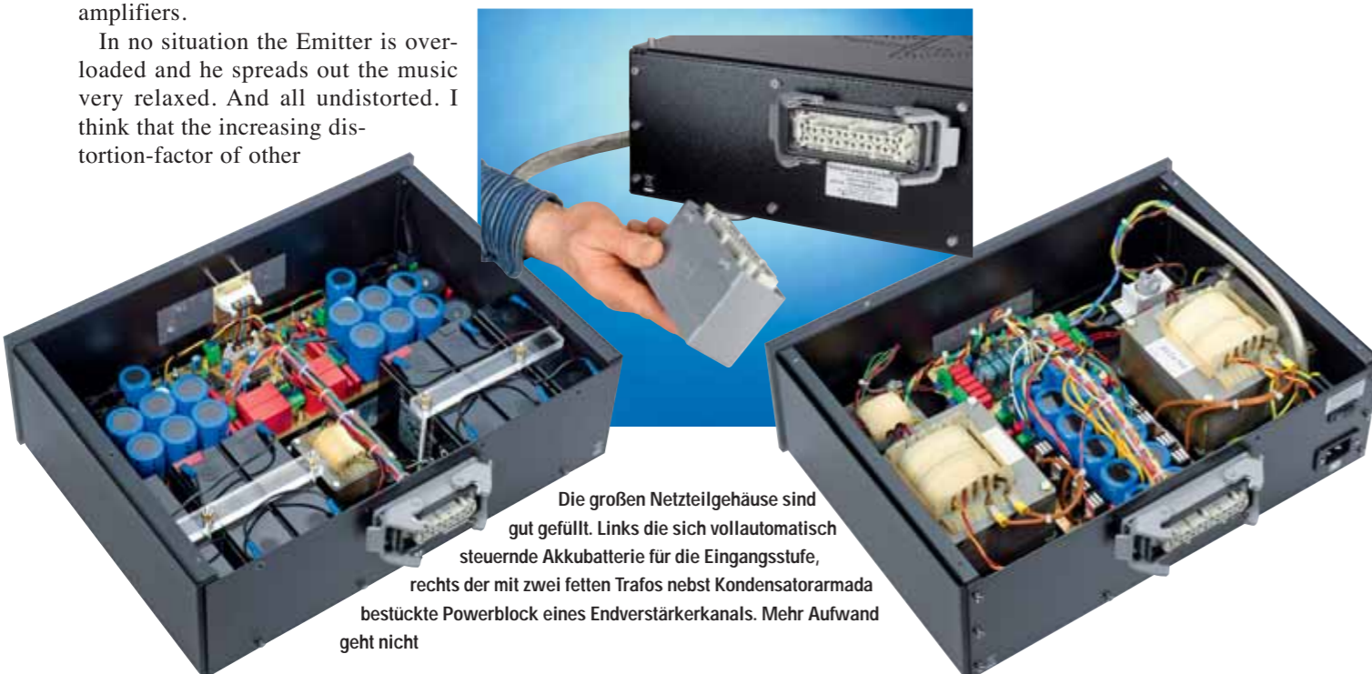
Die großen Netzteilgehäuse sind gut gefüllt. Links die sich vollautomatisch steuernde Akkubatterie für die Eingangsstufe, rechts der mit zwei fetten Trafos nebst Kondensatorarmada bestückte Powerblock eines Endverstärkerkanals. Mehr Aufwand geht nicht

This is the award of the long maturation period of the Emitter II and its consequence to the smallest details inside. So he is fit for the next 27 years!